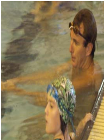
Olympian and world-record holder Aaron Piersol working with swimmers at last month's Texas Gold Clinic.