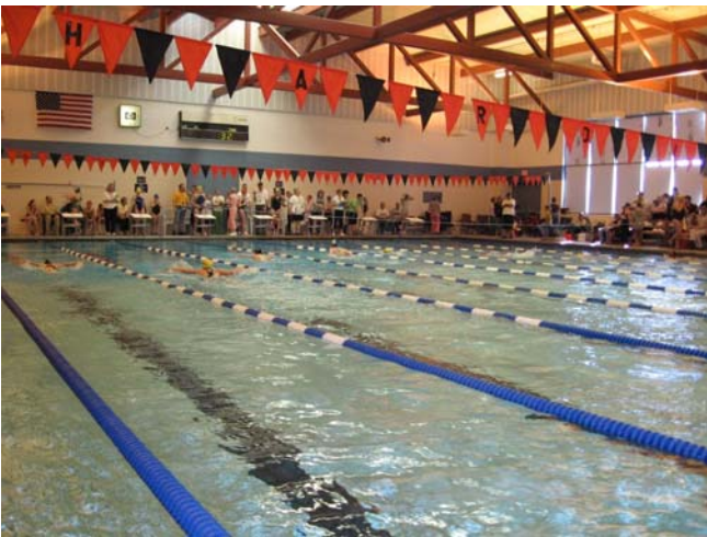
Swimmers racing at a meet.