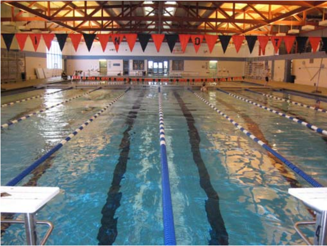
View of the competition pool and warm-up pool from behind the blocks. Plenty of seating on the pool deck for everyone.

The view at the Hardin Community Activity Center pool.