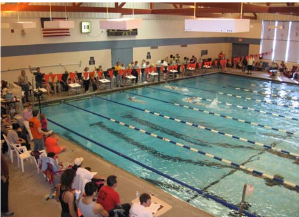
The start end of the pool during a race. Plenty of deck space